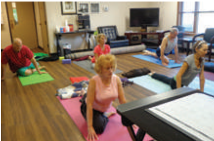
Yoga on Wednesdays

Fee: $10 includes 39 meeting days, a variety of routes, mileage tracking, picnic last day.