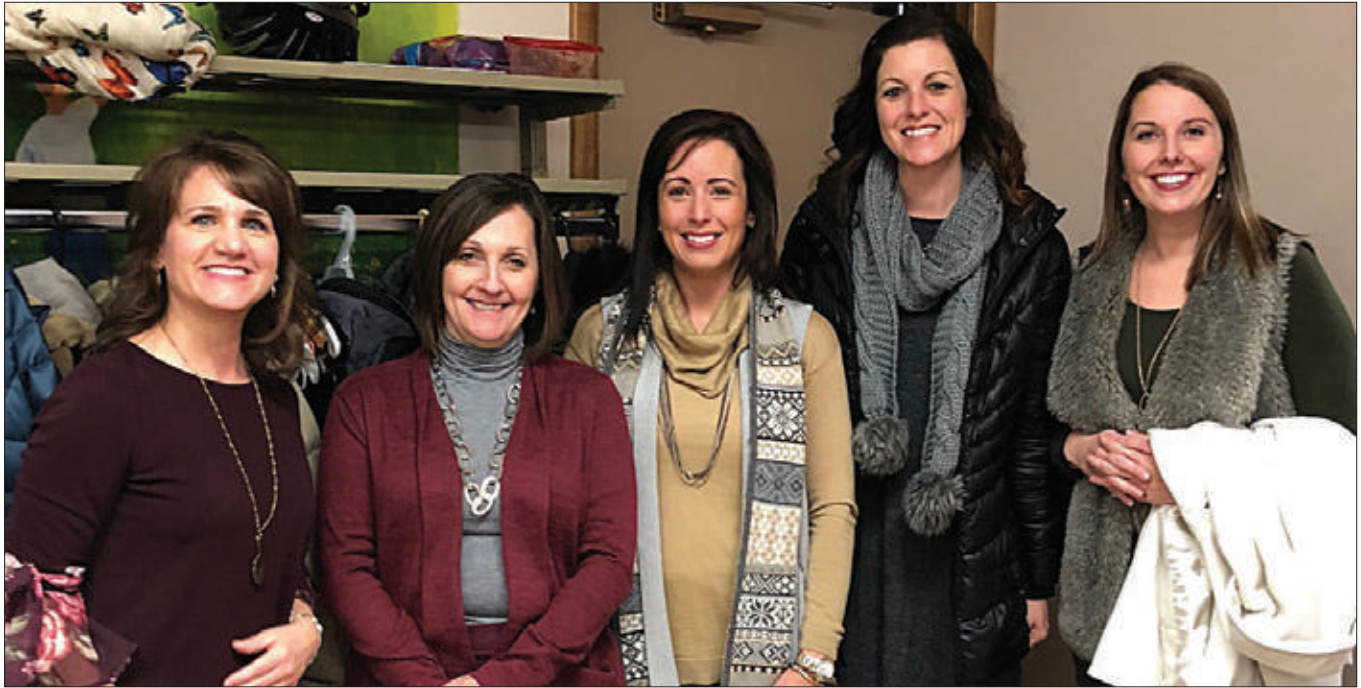
Center Event Sponsors