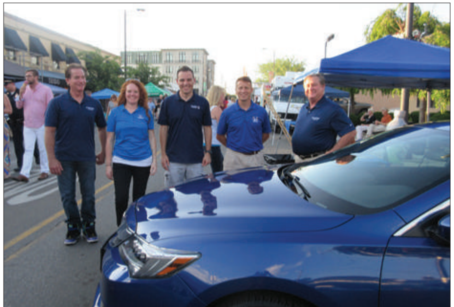
Title Sponsor of The Tour de Grandview Cycling Lindsay Honda and Lindsay Acura

Refund Schedule: Cancellations must be made by contacting the Parks and Recreation Offices. A refund (less a 5% administrative fee) shall be issued when the cancellation is made at least 90 days prior to reservation date. A 50% refund shall be issued when the cancellation is made 30-89 days prior to the reservation date. No refund will be made when the cancellation is less than 30 days prior to the reservation date.